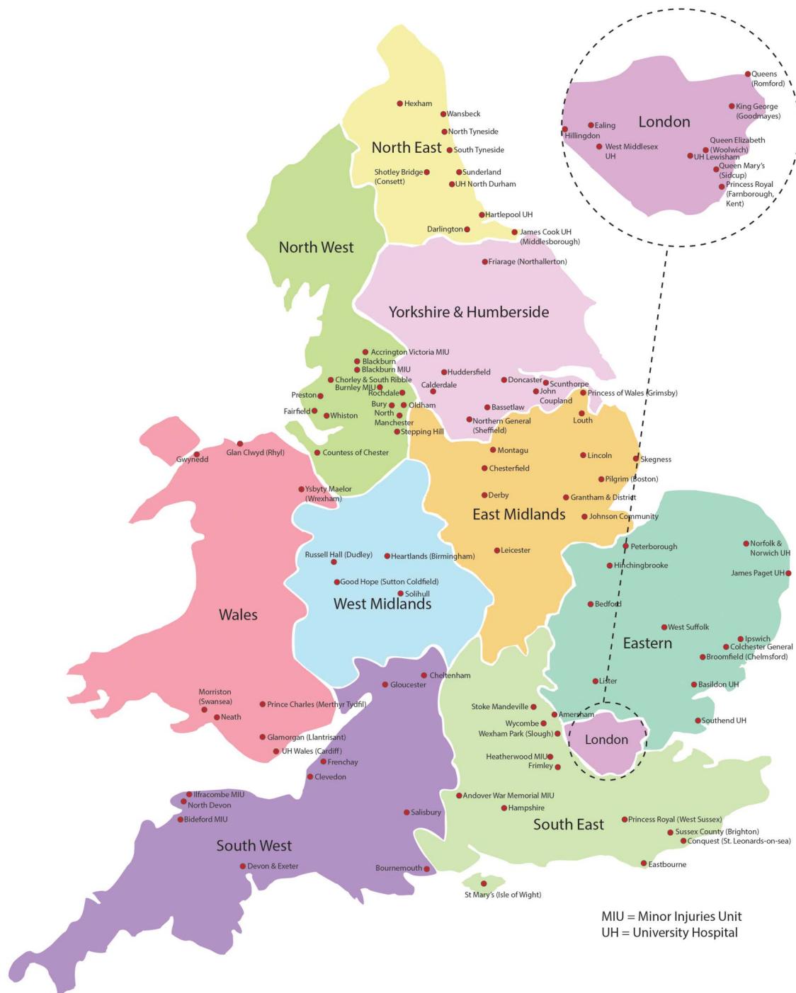
Figure 1 Distribution of EDs (n=100) in the study sample by region, January 2005 to December 2012.

related injury in the North West, North East and Wales. Cross-regional comparisons of dependent and independent variable means and SDs are presented in table 2 .